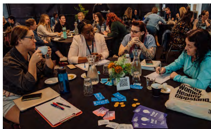
ATTENDEES AT THIS YEARS SRH - ARE YOU COVERED FORUM