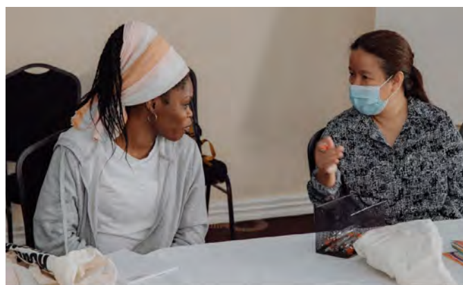
PARTICIPANTS OF THE BREAST SCREEN PROJECT