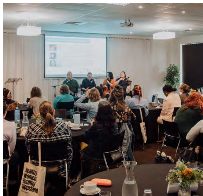
SEXUAL AND REPRODUCTIVE HEALTH FORUM