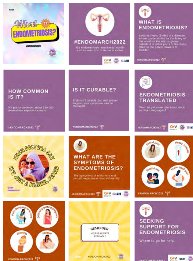
A SAMPLE OF THE ENDOMETRIOSIS SOCIAL MEDIA CAMPAIGN

Social Media Education Awareness which included up to 24 tiles.