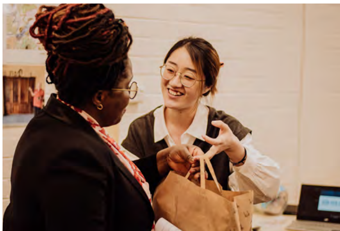
THE WOMHEN PROJECT LAUNCH

This past year has seen increased activity and partnerships across many prevention campaigns such as the Candlelight Vigil and 16 Days of Activism. 2021-2022 saw the development of the '16daysgippsland' web page that provides a range of resources, links and supports for organisations and community members to assist with the 16 Days campaign and other prevention of violence strategies.