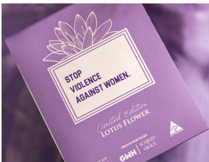
SCARLET & GRACE COLLABORATION - CANDLELIGHT VIGIL 2022