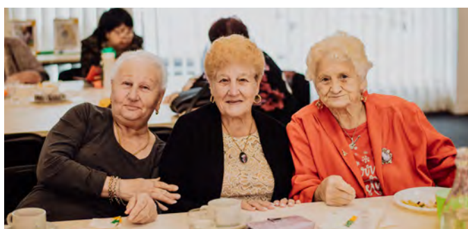
PARTICIPANTS OF THE COVID MEMORY MUSEUM PROJECT